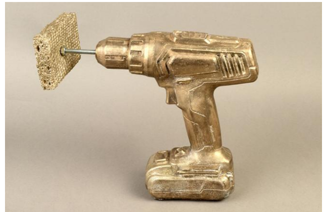
Vered Snear, Life Hack #1 , 2016, bronze and metal