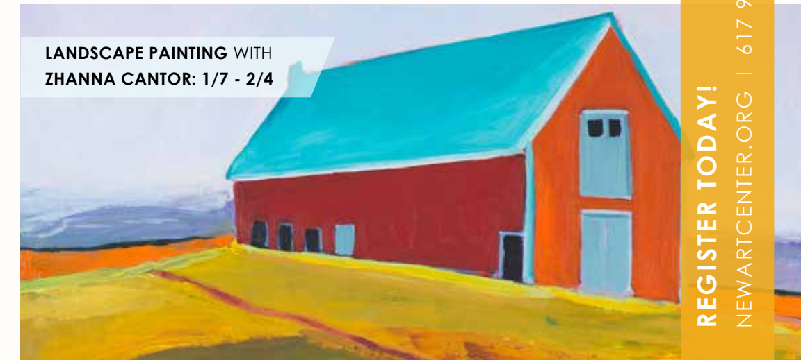
LANDSCAPE PAINTING WITH ZHANNA CANTOR: 1/7 - 2/4

SATURDAY, MARCH 16, 10-AM-4PM COMPOSITIONAL CHALLENGES: LANDSCAPES JILL POTTLE // AWW19223 // $95*