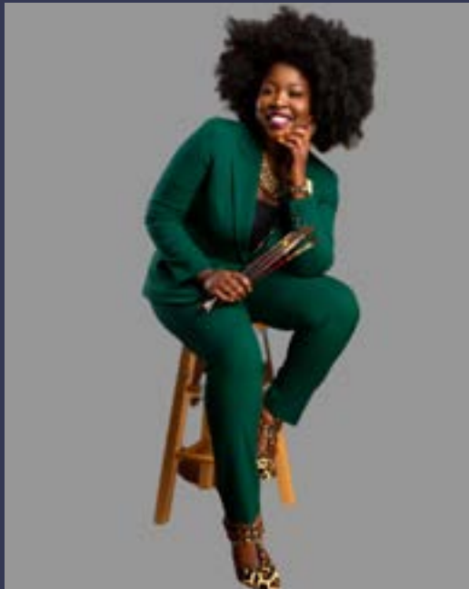
YOUVELINE JOSEPH @youvelinescreations

A special thanks to Contributing Businesses