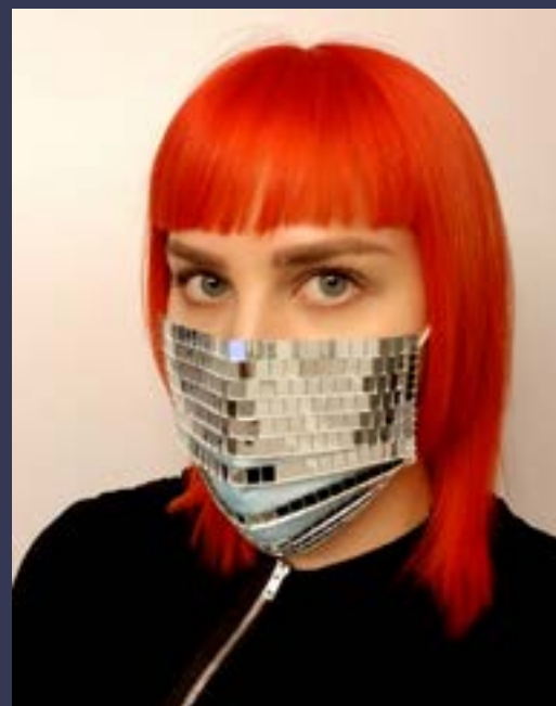
OLA AKSAN @ola_aksan www.olamarieaksan.com