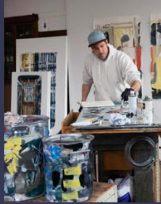
SEAN FLOOD @ seanfloodpainting