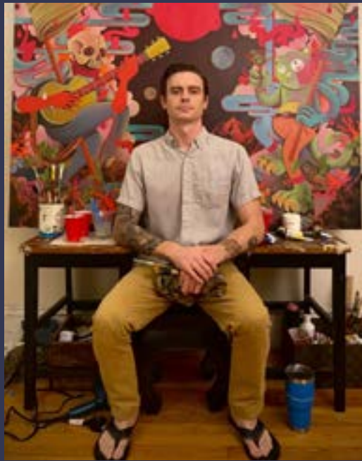
CAL RICE @ calmcrice