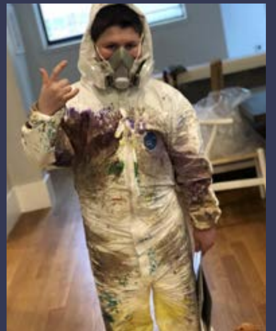
MAX BLACK @maxblack