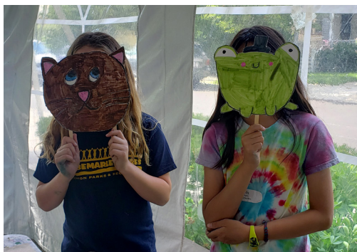
Children Mask Making 2022