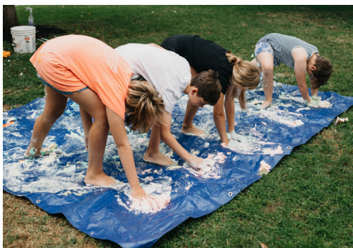
Children's Movement Class 2022

Our 10 week Children's Summer Art Camp is the perfect way to enjoy art over your summer vacation! Each session explores 5 exciting activities based on the week's theme with new projects each week, perfect for all experience levels. No two weeks are the same so sign up for multiple to have even more fun!