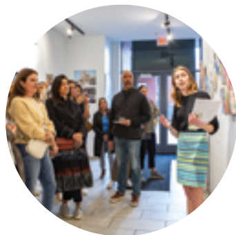
ASWAT artist talk and exhibition tour.

as a response to the rising national unrest, the BIPOC Curatorial Program enables curators who identify as Black, Indigenous, and People of Color to develop and share exhibitions that spark dialogue, and share personal vision and personal experiences through curation.