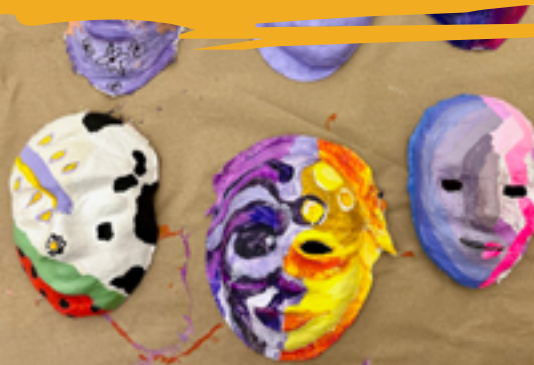
Art as Therapy students created masks to celebrate their identities

Weekly sessions are held on either Mondays from 4:00PM- 5:00PM, or 5:30PM – 6:30PM, depending on group assignments. Groups are led by registered art therapist Erin Palazzolo-Loparo, MS-ATR alongside New Art's Education Coordinator, Sarah Moriarty. Tuition is calculated on a sliding scale ($10-$50 per session) based on household income. Interested students should apply on the website. Accepted students will be contacted and asked to complete the registration process. This program and its facilitators are not performing any diagnostic evaluations/assessments or acting in the role of a primary therapist or mental health counselor.