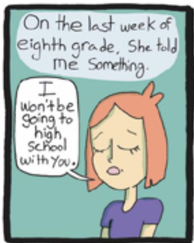
Tell your story in pictures. Mini graphic novel by Liz Young