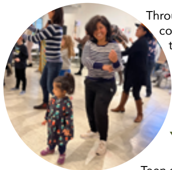
Dancing during our Festival of Lights Community Cultural Day.

Throughout the year, we host free community art making events celebrating the cultural fabric in our community. We work in partnership with cultural groups in Newton and beyond to develop programming that is culturally significant, which includes dance, performance, and art-making activities.