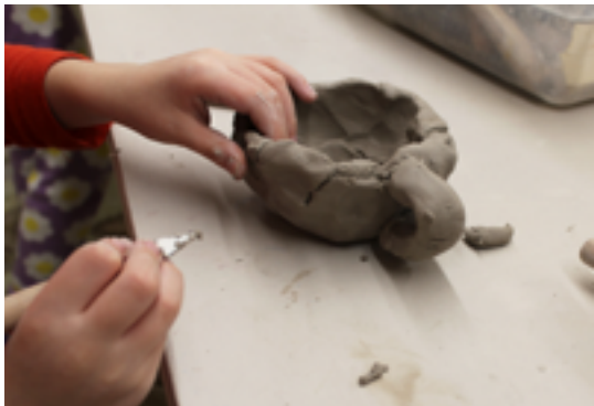
A child plays with clay

All Levels, 9 Fridays, 9/22-12/1, 3:30 PM-4:45 PM, no class 11/10, 11/24 $335