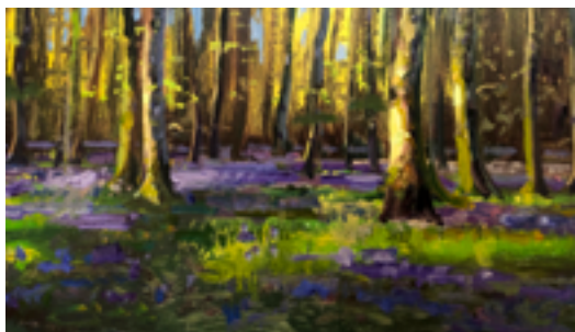
Spring Bluebells by Vincent Crotty

If you have always wanted to learn or revisit how to use a potter's wheel, this is the course for you! Demonstrations and one-on-one instruction help students learn wheel throwing techniques and how to use slips and glazes. See Ceramics Policies online for information regarding studio regulations and safety precautions at New Art Center. Tuition includes 25 lbs. of clay, firing and glazing. All Levels, 12 Tuesdays, 9/12-11/28, 6:00 PM-9:00 PM $910