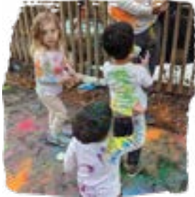
Color Play during our Holi Community Cultural Day.

Throughout the year, we host free community art making events celebrating the cultural fabric in our community. We work in partnership with cultural groups in Newton and beyond to develop programming that is culturally significant, which includes dance, performance, and art-making activities.