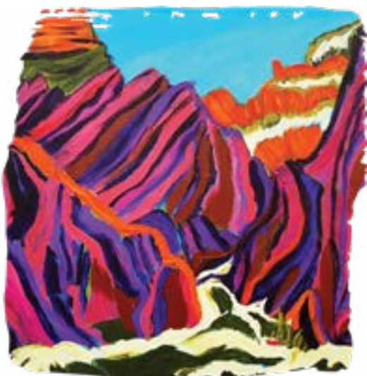
Striped Mountains by Madhavi Ravela

This course for advanced painters offers the chance to develop individual work within a group context. Individual painting and drawing development is facilitated through one-on-one discussions with the instructor and group critiques. No oil paint or oil paint products are allowed for this