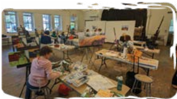
Students work on their paintings