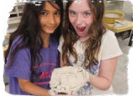
Two students share their clay creation

We envision the New Art Center as a highly visible, bold, anti-racist, inclusive leader in art education and community building that serves the Newton and Greater Boston community with programs and opportunities both in our facility and beyond those walls.