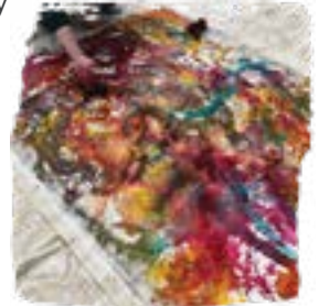
Art as Therapy students work on a group abstract piece.

Visual arts are an important tool for self-expression and emotional regulation. We offer an expressive arts therapy program for teens and tweens on a sliding-scale, and private art experiences for women and families seeking shelter from domestic violence. Art as Therapy will have sessions for GR 6-8 this spring. Visit newartcenter.org to learn more!