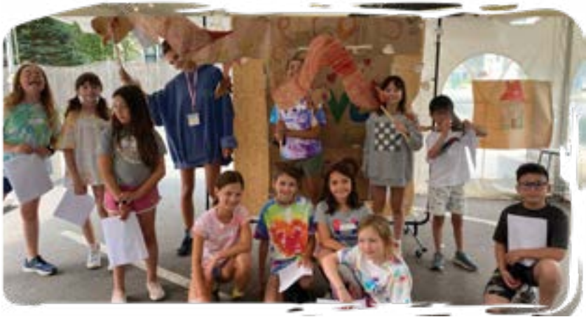
Campers gather for their performance, Summer 2023

Card to Culture is a collaboration between the Mass Cultural Council and the Executive Office of Health and Human Services' Department of Transitional Assistance, the Women, Infants & Children (WIC) Nutrition Program, and the Massachusetts Health Connector.