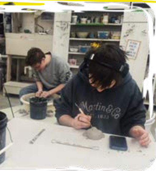
Teens work on their ceramic skills

unique patterns on fabric using the natural dye indigo. Shibori, or “physical resist,” has been a traditional pattern-making technique throughout history. This workshop will begin with a brief discussion of the history of Shibori and Indigo, with a wide array of examples and demonstrations. We will begin experimenting with various pattern techniques such as Kumo (binding), Ori-Nui (stitching), Itajime (clamping) and Arashi (pole wrapping).