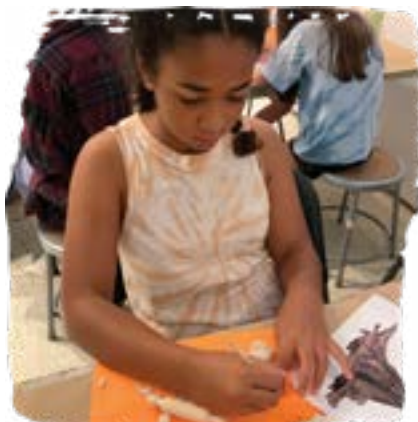
A student creates a sculpture from clay

The New Art Center offers children a fun, skill-building experience in a fully-equipped ceramics studio using a