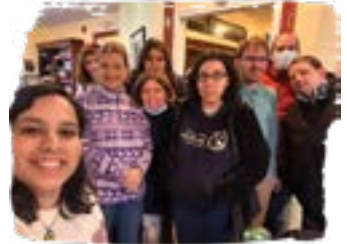
Brigham House Artists

We provide weekly, private outreach classes for developmentally-delayed young adults and students with language-based learning disabilities.