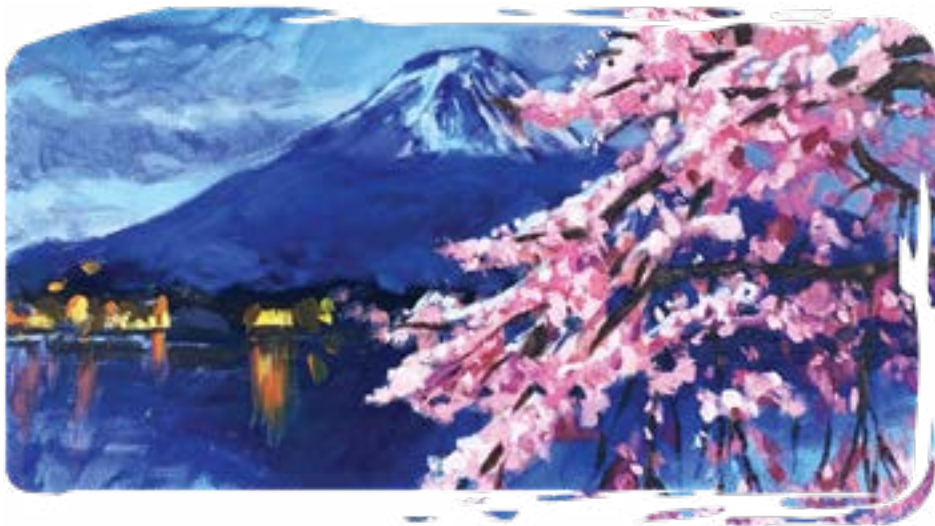
Cherry In Fuji by Emm Tian