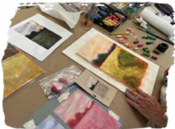
Working with pastels