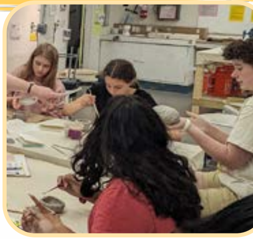
Teen Ceramics Studio 2023