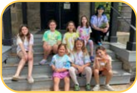
A group takes a break during recess