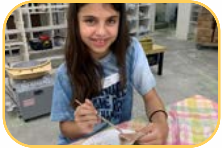
Children Clay Class 2023