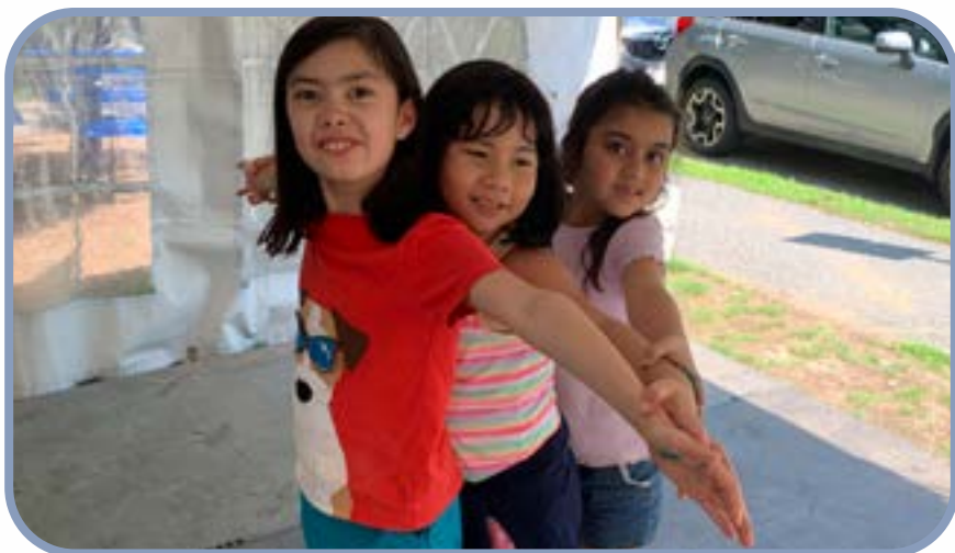
Students in Movement make an animal shape together