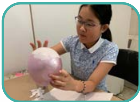
Children 3D Class 2023

Throughout art history, artists have been inspired by the cosmos: stars, planets, and galaxies, which dazzle the eyes and ignite the imagination. Students will make out-of-this-world creations, using shape, form, and color, while imagining what awaits us beyond our solar system.