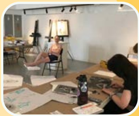
Teen 2D Studio 2023

Our teens enjoy week-long studio intensive programs led by professional artists. Perfect for all experience levels, this is a great opportunity for teens to explore their interest in art, learn new techniques and skills, or build their portfolio. The curriculum is challenging and flexible, offering plenty of opportunity for self-expression while working with other teens. We group students by grade and maintain a high teacher-to-student ratio for a personalized experience with our faculty. All materials are provided.