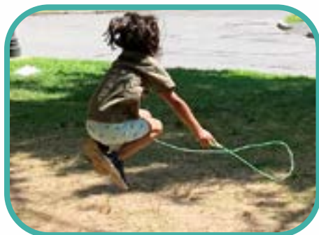
Children's Movement Class 2023