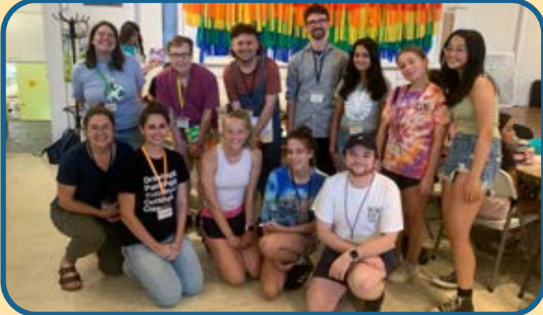
New Art 2023 Summer Art Camp Teachers and TA's

Join us under the dazzling lights of the big top as we draw inspiration from aerial acrobats, colorful clowns, and marvelous magicians to create sculptures, comic books, and ceramic work. Students will explore form, color, and texture as they explore the magic, mystery, and mayhem of circus life.