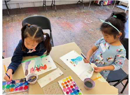
Students Painting with Watercolor

The New Art Center offers children a fun, skill-building experience in a fully-equipped ceramics studio using a variety of tools, objects and techniques including coiling, pinching, sculpture, and slab construction. Guided by our