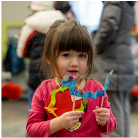
2025 Lunar Year Celebration Community Cultural Day.

Throughout the year, we host free community art making events celebrating the cultural fabric in our community. We work in partnership with cultural groups in Newton and beyond to develop programming that is culturally significant, which includes dance, performance, and art-making activities.