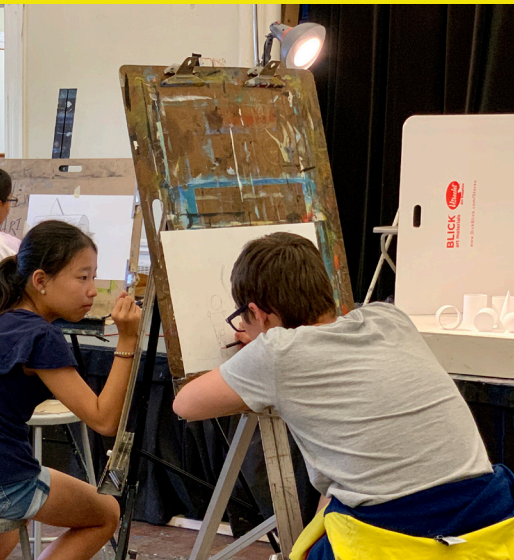
Teens work on their drawing skills