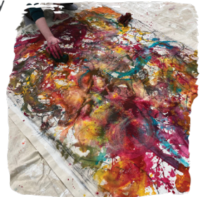
Art as Therapy students work on a group abstract piece.

Visual arts are an important tool for self-expression and emotional regulation. We offer an expressive arts therapy program for teens and tweens on a sliding-scale, and private art experiences for women and families seeking shelter from domestic violence. Art as Therapy will have sessions for GR 6-8 this spring. Visit newartcenter.org to learn more!