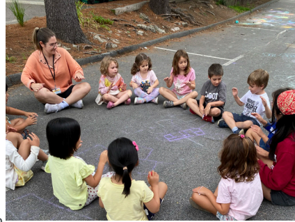
outdoor activity at our Summer Camp

We envision the New Art Center as a highly visible, bold, anti-racist, inclusive leader in art education and community building that serves the Newton and Greater Boston community with programs and opportunities both in our facility and beyond those walls.