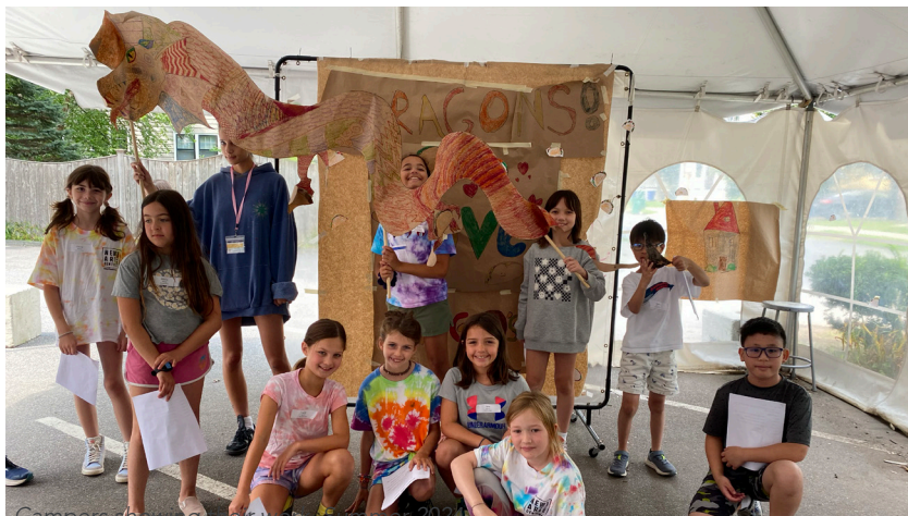
Campers showing their work, Summer 2024

Card to Culture is a collaboration between the Mass Cultural Council and the Executive Office of Health and Human Services' Department of Transitional Assistance, the Women, Infants & Children (WIC) Nutrition Program, and the Massachusetts Health Connector.