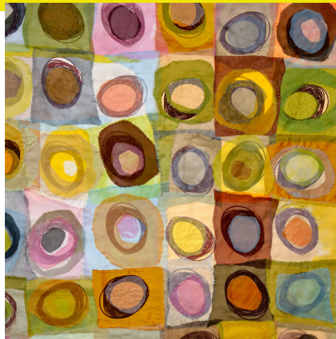
Gignoux Marguerite Artwork

This expressive art therapy group provides a safe and responsive space for young teens to create, connect, and share in a variety of art modalities in a confidential community environment. Mindfulness and ego-building weekly art exercises allow teens to access, express, and transform feelings and struggles into meaningful art forms. Weekly sessions are held on either Mondays from 4:00PM - 5:00PM, or 5:30PM - 6:30PM, depending on group assignments. Tuition is calculated on a sliding scale ($10-$50 per session) based on household income. Interested students should apply on the website. Accepted students will be contacted and asked to complete the registration process. This program and its facilitators are not performing any diagnostic evaluations/assessments or