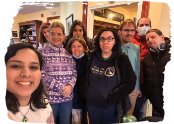
Brigham House Artists

We provide weekly, private outreach classes for developmentally-delayed young adults and students with language-based learning disabilities.