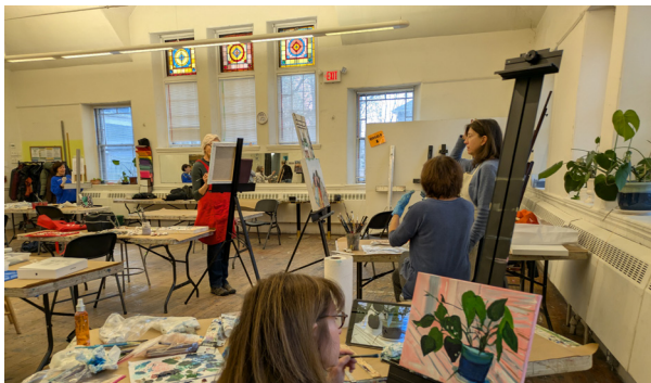
Students work on their paintings