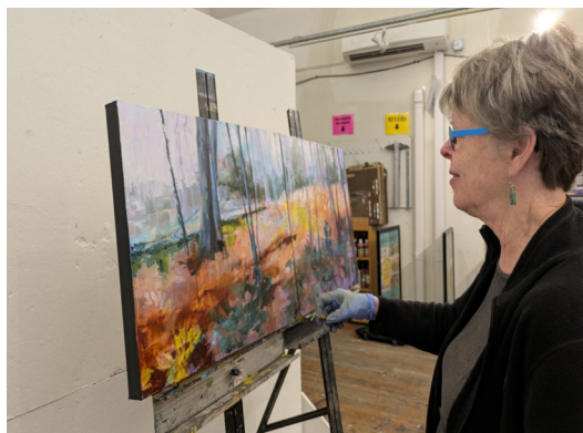
A student in an Oil painting Class

Students will create their own unique clothing in this 1 day workshop! Students will bring in their own desired fabrics and clothes, and use a safe bleach solution to create intricate designs using natural objects and