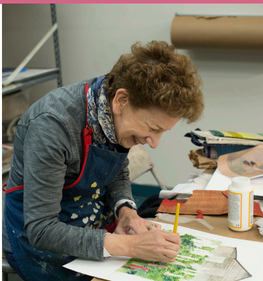
A student in a Mixed-Media Class

Enjoy painting at your own level and at your own pace in this supportive class environment, with one-on-one teacher/student interaction. Unlock your hidden talents or expand the talents you have already nurtured. Learn to express yourself by working from a picture of your choice or a still-life set up, exploring all the steps of the painting process, including composition, and paint mixing