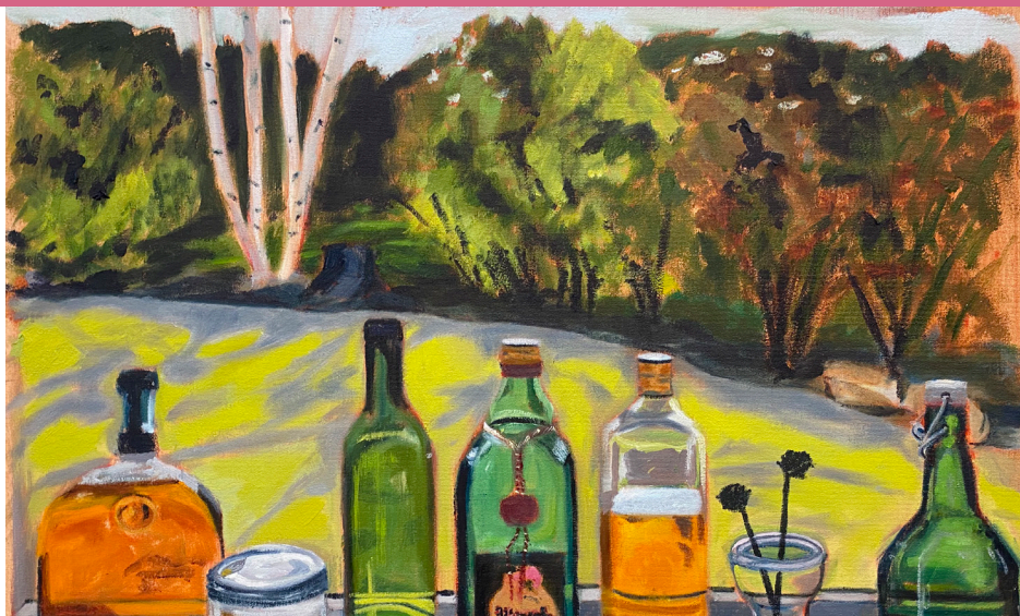
An unknown Student Art work (Oil Painting)